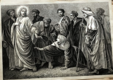
Luke 8: 43-48

But then Jesus asked, "Who touched me?" for he perceived that power had gone out from him. When the woman realised she had been discovered, she declared in the presence of all the people her reason for touching him, and how she had been immediately healed. At that point Jesus said to her — "Daughter, your faith has made you well; go in peace."